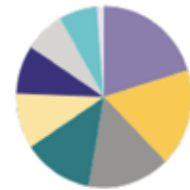
Share of Labour Force Population (Aged 15+) by Occupation